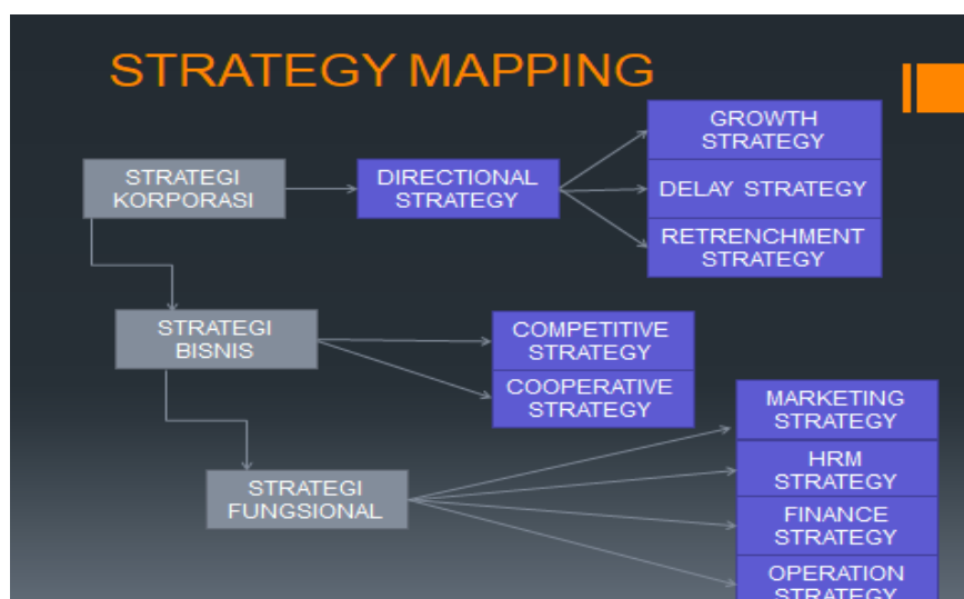
Gambar 1.1 Strategi Mapping (1)

The second level is Business Strategy. which is a level of strategy formulated and implemented by the middle level of management or midle management where in the scope of MSMEs, especially micro-scale ones, this strategy is still formulated and applied by owners or actors and business pioneers. In this section, the perpetrators determine whether their efforts will carry out competitive actions (tend to attack, compete) either directly, indirectly, or overtly and clandestinely. The last level is the Functional Strategy, which is the level of strategy formulated and implemented by the lower level of management ( low management ) where within the scope of MSMEs, this strategy is formulated by the top level such as the owner and carried out by workers in the business. In this section, it is also determined how the business strategy in each of the 4 business functions, namely the Marketing, Finance, Operations, and HR functions.